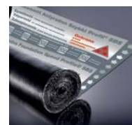
Speed Profile® SBS Specialist membrane Anti -Radon Foundation Speed Profile SBS