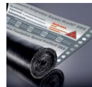
Speed Profile® SBS Specialist membrane Anti -Radon Foundation Speed Profile SBS