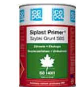
Speed Primer SBS priming agent Siplast Primer® Speed Primer SBS