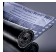
Speed Profile® SBS Specialist membrane Foundation Speed Profile® SBS