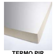
TERMO PIR heat-insulation - foundation walls - two-layer wall - floor