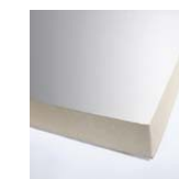
TERMO PIR heat-insulation - foundation walls - two-layer wall - floor