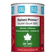
Speed Primer SBS priming agent Siplast Primer® Speed Primer SBS